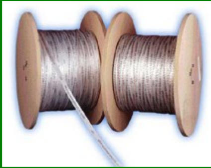
Detectable Mule Tape