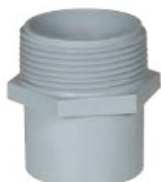
Male Threaded Adapter