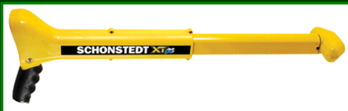
Pipe & Cable Locators