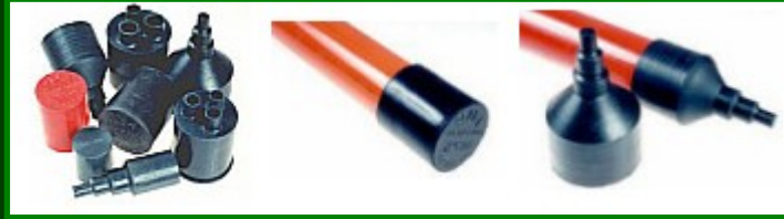
Pull Head End Caps